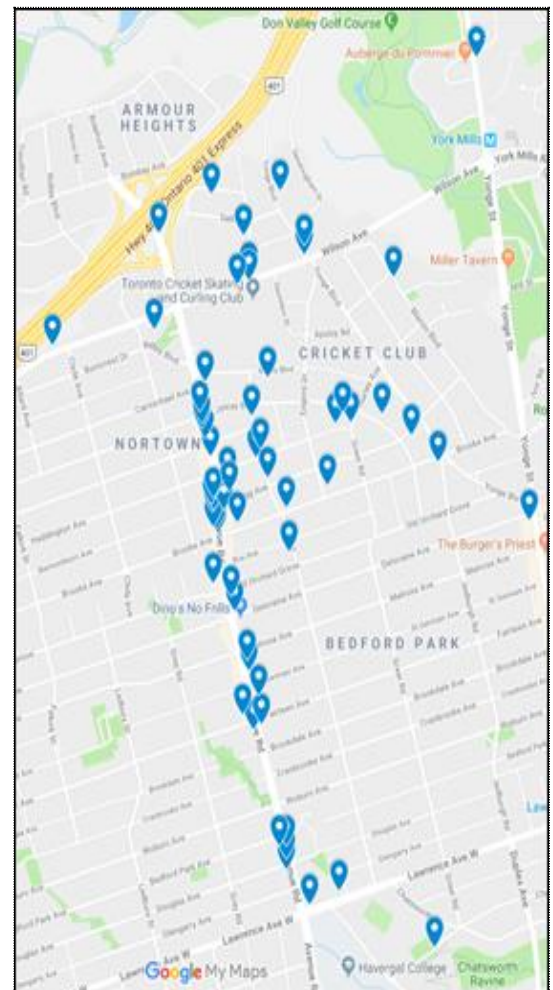
2018 Activity Map

Please send your email address and physical address to info@sahratoronto.com so we can keep you up to date by sending you eBlasts and the Newsletter electronically.