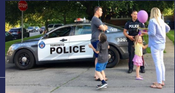
2019 Neighbours' Night Out